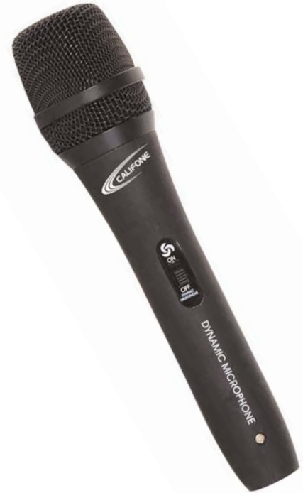
Frequency Response PADM-515